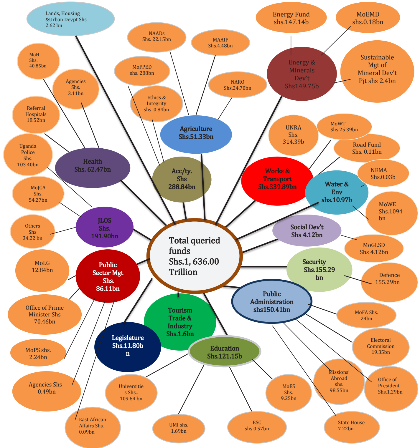
Figure 2: Sector Disaggregation of Queried Expenditure (2006/07 to 2010/11)