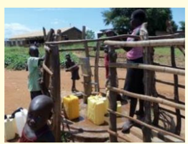
Figure 1: Children drawing water from one of the boreholes in Kal Parish, Atiak Sub-county

The extension of the national power grid to Moyo and Adjumani districts via Lamogi, Pabbo and Atiak sub-counties was in an advanced stage at the time of assessment. The extension of the national power grid is expected to help Amuru District extract and market its resources and boost locally-generated revenue. The Great Juba Road that passes through Amuru District provides access to the South Sudan market and, with the plan to construct a modern border market at Elegu in Bibia parish, is likely to be a catalyst to Amuru's economic growth through cross-border trade.