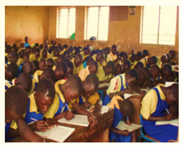
Figure 2: Overcrowded P4 classes in Reckiceke P7 School, Amuru Sub-county

In partnership with Civil Society Organisations (CSOs), Amuru District Local Government constructed classroom blocks under NUDEIL in Kaladima P7 and drilled eight shallow and ten deep wells with support from World Vision and JAICA. The district also registered a slight improvement in the performance of the national priority programme areas (NPPAs).<sup>4</sup> In the education sector, there was general improvement in PLE examinations with most pupils passing in Division I, 2 and 3 and pupil enrolment was 133.9 per cent.