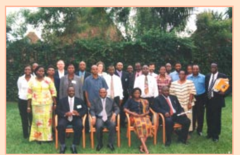
Participants at the NWP workshop. Seated second form left is Minister Isaac Musumba

Applying the NWP framework in our analytical work and future monitoring of PEAP implementation presents us with an opportunity to ask the right question: does improvements in the quality, quantity and economic value of natural resources per se lead to economic development and poverty reduction?