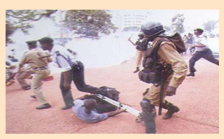
Daily Monitor Photo: Roit Police confront demonstrators at the streets of Kampala city after the arrest of the FDC leader, Kizza Besigye

should be non-partisan and national in character.<sup>24</sup> Principle II of The code of Conduct for Security Personnel<sup>25</sup> enjoins security forces to remain neutral and not to overtly participate in partisan political activities. The Code further requires them to restrict themselves to the maintenance of law and order.