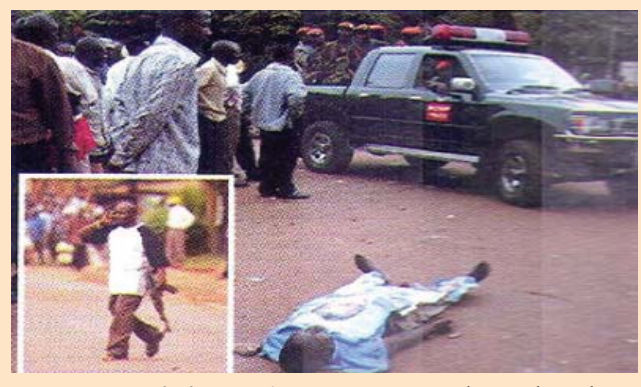
A man lies dead after a soldier attached to the office of the deputy RDC Rubaga (inset) fired live bullets into the crowd of FDC supporters who were waiting to greet their presidential candidate at Bulange