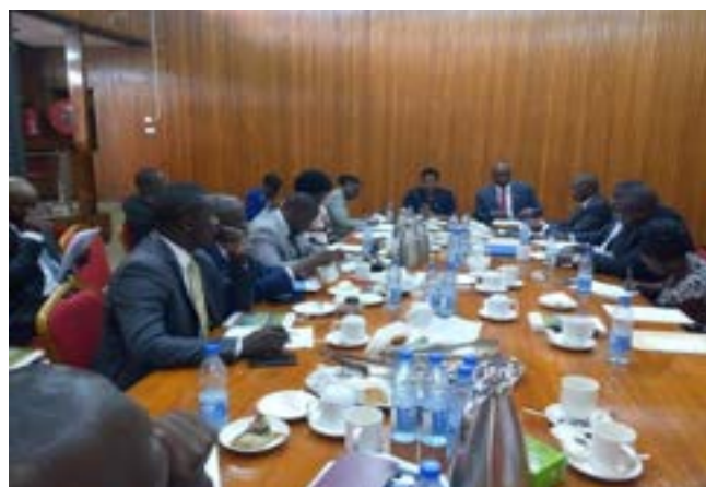
ACODE was invited to interface with the Parliamentary Committee on Climate Change and a position paper was presented

ACODE partnered with Environmental Management for Livelihood Improvement Bwaise Facility (EMLI) and Environmental Alert under the auspices of Environment & Natural Resources-Civil Society Organizations (ENRCSO) Network and CAN-U to organise a CSO Consultative Workshop on the National Climate Change Bill on July 29, 2020. The main objective of the Workshop was to deliberate on the National Climate Change Bill, 2020. A position paper was prepared and shared with the Parliamentary Committee on Climate Change.