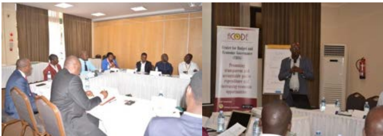
Participants at the validation workshop held in Kampala

This activity was about validating a study that was conducted on Public Expenditure Governance in the Roads sector. Participants that turned up for the meeting included officials from road sector agencies including Uganda National Roads Authority (UNRA), Uganda Road Fund (URF), Kampala City Council Authority (KCCA), Kira Municipality, Wakiso District and Mukono District. Other participants were drawn from major road sector funding agencies including the World Bank and the African Development Bank (ADB). The findings were well received by the actors who were greatly interested in finding reasons for two issues namely, concentration of all-weather roads in the western central and eastern parts of the country leaving the Northern region behind, and absence of clear road costing parameters.