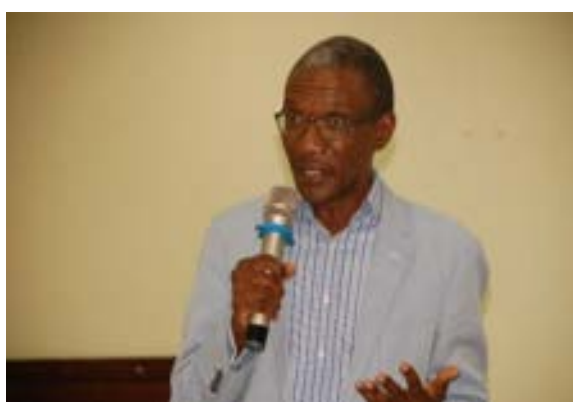
Care International in Uganda Country Director giving his opening remarks at the dialogue

ACODE supported and partnered with the National Planning Authority (NPA) to undertake a climate change integration compliance assessment of the alignment of the 2020/21 sector Budget Framework Papers (BFPs) to the Third National Development Plan (NDP III). The assessment sought to: evaluate the alignment of the Financial Year (FY) 2020/21 sector BFPs to the NDPIII climate change interventions; identify the emerging issues, key messages, and recommendations to inform and guide the integration and implementation of climate change interventions and lastly, to inform and enhance advocacy and lobbying for climate change mainstreaming in sector plans and annual budgets. A report of this assessment was prepared and presented to ACODE.