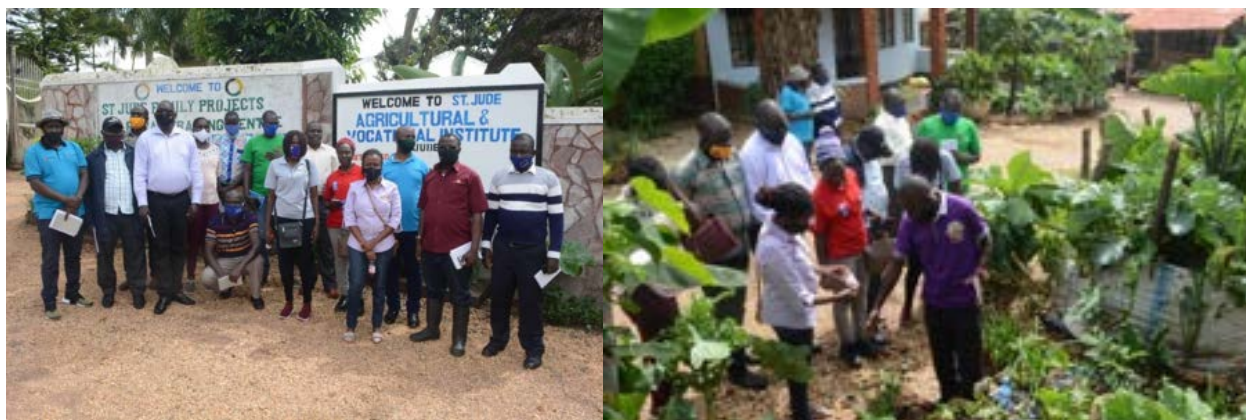
The team during the Natural Resources and Climate Resilience Forum Inter District Learning Visit that took place at St. Jude Training Centre

ACODE organized a learning visit for some of the forum members to St Jude Training Centre for Intensive Integrated Sustainable Agriculture in Masaka on 16th November 2020. The major objective of the learning visit was to enhance the knowledge of the forum members on best climate resilient practices. After the visit, the team committed to replicate some of the practices for example soil and water conservation practices such as terracing, ditches, plastic bottle banding which help against soil erosion and conserve the soils.