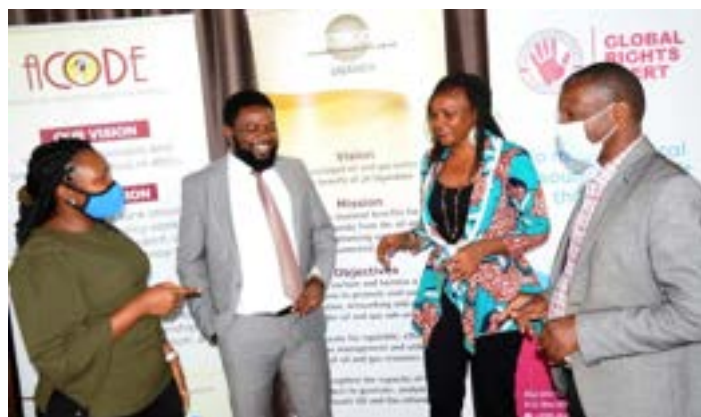
Some of the CSCO members share a light moment after the press briefing

ACODE, CSCO and other CSOs have been at the forefront in advocating for this step to enhance sustainable development of the extractives sector. At a press brief organized by CSCO on 13th August 2020, the civil society fraternity congratulated the Government of Uganda upon the achievement and pledged its commitment to work with all other stake holders for the successful implementation of EITI in Uganda. A press statement was released to further draw attention to major issues as Uganda embarks on this journey of implementing EITI in Uganda.