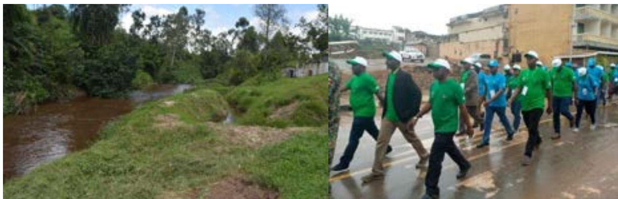
L-R: A section of a degraded River Rwizi and participants marching through Mbarara town to create awareness of the dangers of environmental degradation

At the symposium, stakeholders discussed the potential disappearance of the River Rwizi and identified areas of intervention to restore and reverse the crisis of River Rwizi degradation. By the end of the symposium, the Ministry of Water and Environment had made commitments to restore River Rwizi.