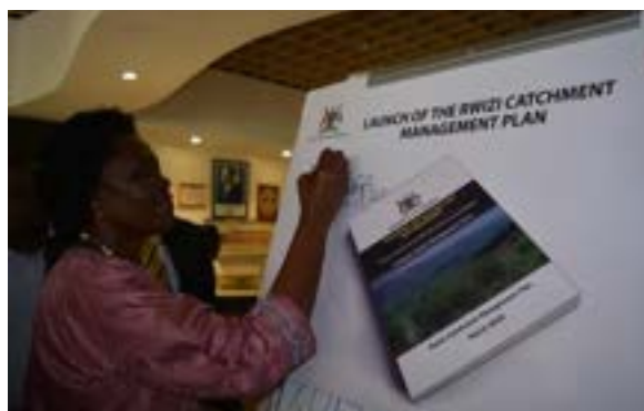
The Minister of State for Environment, Hon. Beatrice Anywar officially launching the Rwizi catchment Management Plan

ACODE supported the Ministry of Water and Environment to finalize the Rwizi Catchment Management Plan which was launched by Hon. Beatrice Anywar, Minister of State for Environment at Lake View Resort Hotel in Mbarara on 19th March, 2020 during the symposium on restoration of River Rwizi and enhancing a transition to a green economy.