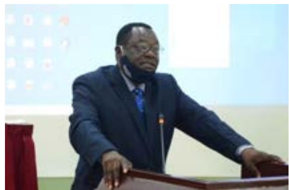
The Acting Director for Environmental affairs and commissioner for Wetland Department at the Ministry of Water and Environment at the event

The keynote presentation was delivered by the Acting Director for Environment Affairs and Commissioner for Wetland Department at the Ministry of Water and Environment. ACODE and other partners were appreciated for supporting the Ministry of Water and Environment activities. At the dialogue, it