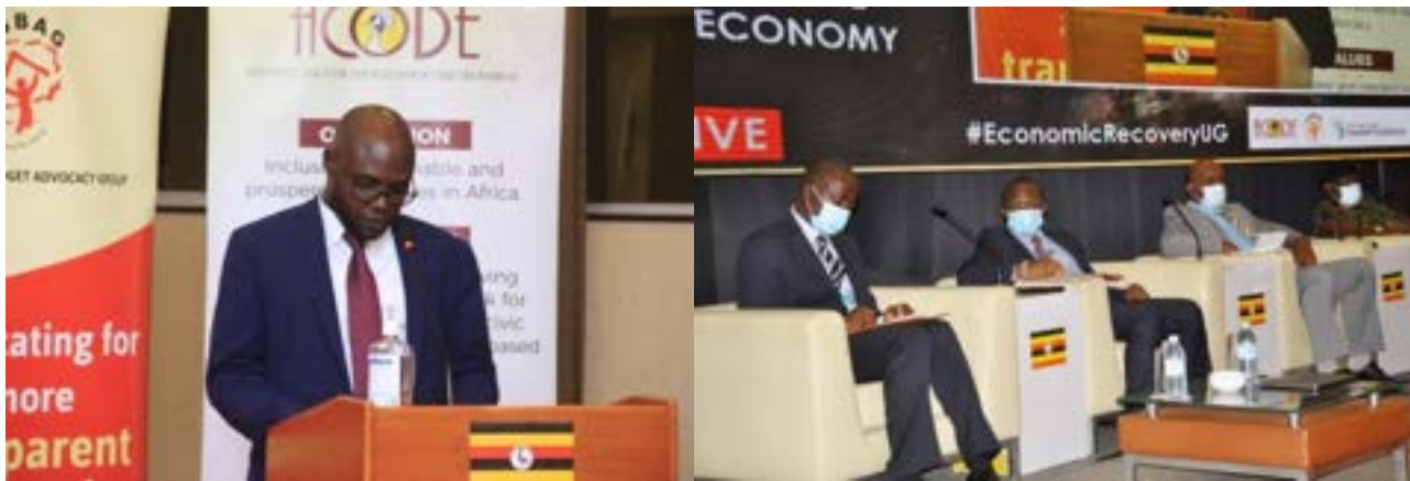
Panelists at the dialogue held in Kampala

Economic experts provided recommendations and discouraged the weak regional approach in the fight against the pandemic, over taxation of the already struggling sectors like tourism and education, and limited access to Covid-19 relief funds. The dialogue proceedings were covered widely by both print and electronic media.