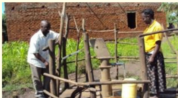
Figure 2: Community members accessing water at a borehole in Marare

Mbale District's safe water coverage stood at 64 per cent in the FY2013/14 indicating a slight improvement from 62.5 per cent in FY2012/13. However, access rates varied, with urban areas at 94 per cent and lowlands at 62 per cent. The functionality rate in urban and rural areas stood at 95 and 89 per cent, respectively. Meanwhile the latrine coverage was at 87.2 and the percentage of people that could access the hand washing facility stood at 77.4 per cent.