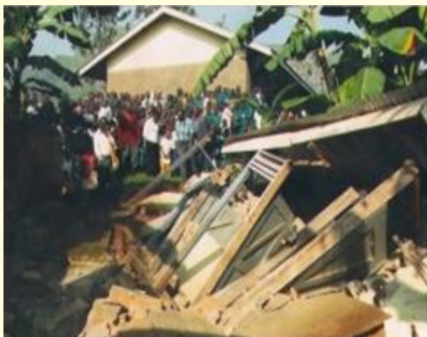
Figure 1: A collapsed pit latrine at Bukikoso primary school

levels of absenteeism, the late release of funds to the education sector and the limited participation of parents in the education of their children.