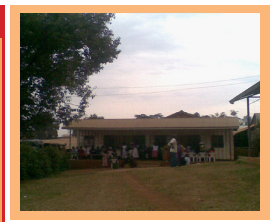
Patients waiting for services at Kawaala Health Centre on 10th June 2010

assistant, a nursing officer and a store keeper welcomed us with a warm smile. Nevertheless, it was evident from her looks that she was already tired at this early morning hour of 11:00 am. Having no space for visitors, we squeeze ourselves in her small office that not only serves as a store for drugs but also keeps other facility valuables like jerry cans of paint