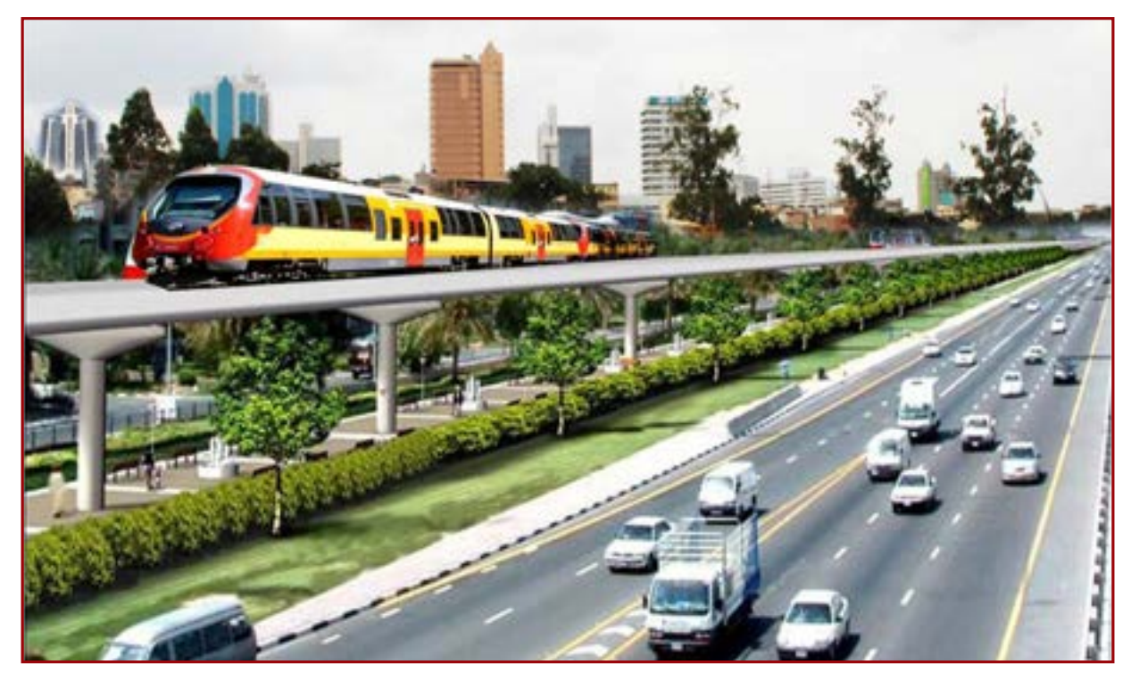
Multi - Modal Transport System (planned)

Transport: The strategic interventions include<sup>70</sup> supporting planned multimodal and mass transport systems for urban areas comprising of the Bus Rapid Transport system (BRT) and the Light Railway Transport (LRT); and supporting development, utilisation and interconnectivity of the planned Standard Gauge Railway for the country.