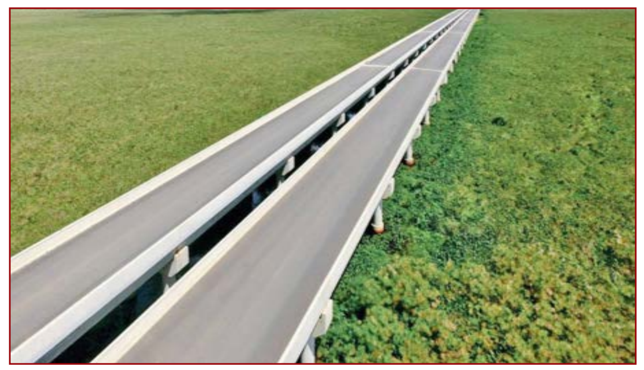
Sustainable Transport (Kampala - Entebbe Expressway). The country needs, at the minimum, similar but much bigger expressways, linking Kampala to Jinja, Mbarara, Hoima and Gulu.

A number of green innovations have been implemented including; solar powered street lighting, green belts and amusement parks, improved waste management and drainage systems, express ways and ring roads to reduce congestion and ease mobility and increased taxation on high emission old vehicles. Plans are also underway to develop flyovers and underpasses to reduce traffic congestion within the Greater Kampala Metropolitan Area (GKMA).