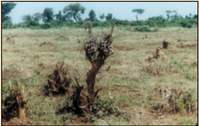
local politicians who have The photo shows the extent of deforestation of South Busoga Forest Reserve. At this rate of forestry enchrochment S. Busoga

In early 2005, the National Authority Forest (NFA) embarked on nation wide strategy of evictions. These evictions in South Busoga Forest Reserve and else where in the country have been met with a lot of difficulty arising from political incitement by made political capital out Forest Reserve will soon extinct! of it While NFA is blamed for inadequate sensitization by affected communities, the