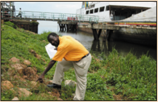
prevent gross environmental Is Lake Victoria drying up too?. An official from National Environmental Management Authority (NEMA) showing the mismanagement<sup>19</sup>. Ultimately, declining levels of water in Lake Victoria. Uganda was recently conservation plunged into an energy crisis due to prolonged drought and reduced water in R. Nile.

As some analysts have pointed out, the more citizens are able to know about the environment, to express their opinions and to hold their leaders accountable for their performance. Also, the level of citizens' awareness the about environment, the more they are likely to environmental and sustainability reduces the potential for resources scarcity induced conflicts and creates