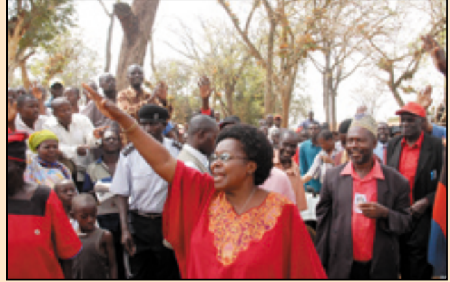
Uganda Peoples Congress (UPC) boss Miria Obote during the 2006 election campaigns. Inspite of her gender appeal towards women, trainingandmobilization Ms. Obote did not link Environmental conservation with women's empowerment to improve their livelihoods. Since majority of women are natural resource dependent.