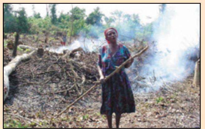
Women clearing part of the forest for cultivation. At this point of forest/ wetland encroachment, the future generation may never have a chance to see how a forest looks like. (cover photo).

is currently experiencing 'warning signs' indicative of environmental mismanagement namely, dry spells in several districts in Uganda, low food harvests<sup>38</sup>, deforestation and drying up of wetlands<sup>39</sup>, the shrinking of Lake Victoria water level<sup>40</sup>, and the imminent closure of one of the Hydro Electricity Power Stations at Jinja.<sup>41</sup> The contradiction between the NRM's stated commitments on one hand and actual practice on the other presents a challenge for policy analysts and conservationists to predict with certainty that Uganda will achieve sustainable livelihoods and sustainable development in the next five years. This scenario leaves environmental organizations and policy advocates one major option to massively sensitize the masses to create awareness that environmental degradation will not only commit them