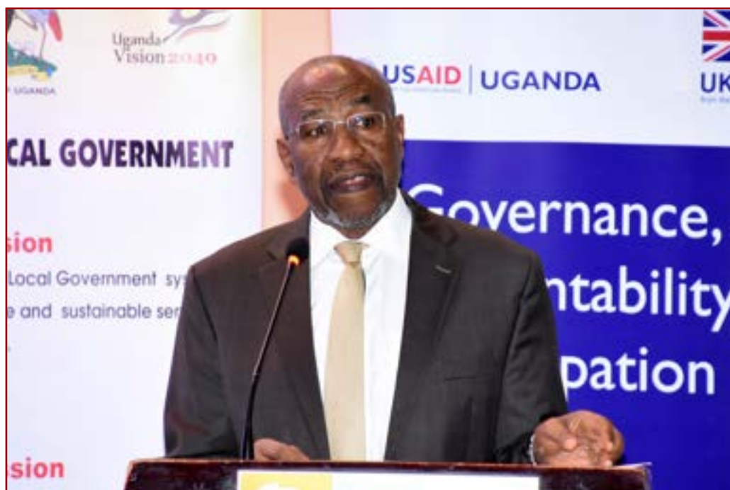
Figure 5: The Prime Minister of Uganda, Rt.Hon Ruhakana Rugunda giving a Key Note Address

Government took initiatives to ensure that the decentralisation policy is put in place within the right political environment and backed by appropriate policy framework. He was “happy to note that this meeting has come at the right time.” The findings of these studies should enable government to maximize returns of the policy and fix gaps that stand in the way of its implementation. Government will study the recommendations of the conference with the view to implementing them to improve service delivery.