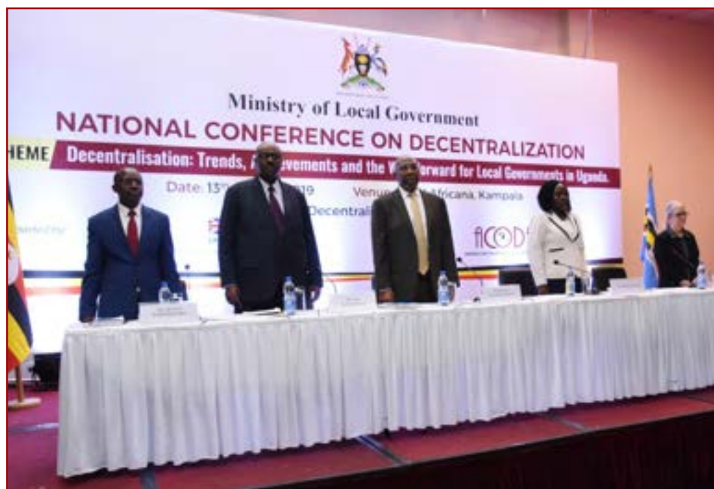
Figure 3: L-R: The Executive Director, ACODE; PS, MOLG; the Rt Hon. Prime Minister of Uganda; Minister of State for LG and Deputy Head of US Mission in Uganda

The conference, he requested, should endorse recommendations of recent studies, to be presented in the conference, to ensure that the objectives designed in 1993 are met. He said he was happy that the Prime Minister embraced and attended the conference. He promised to bring to the Prime Minister's attention the recommendations of the conference, and invited the Minister of LG to give remarks.