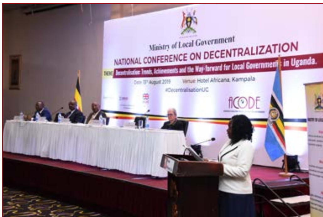
Figure 4: Standing: The Minister of State for Local Government, Hon. Jennifer Namuyangu

newly-created sector meets its objectives – through cooperation, coordination, and support.