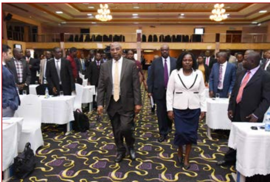
Figure 1: The Prime Minister, Rt. Hon. Ruhakana Rugunda with the Minister of State for Local Government arriving at the National Conference on Decentralisation at Hotel Africana, Kampala

Uganda's local government reform was initiated in 1992 following a report of the Commission of Inquiry in Local Government Systems, and became a concurrent process alongside, or even as part of, public service reforms under the then Structural Adjustment Programs (SAPs). Decentralisation was then provided for under the 1995 Constitution, in the form of devolution. The Policy was operationalized by the Local Governments Act Cap 243 of 1997. Decentralisation was crafted as a means to modify, reform, and improve local governance in order to improve service delivery and local development. Uganda decentralized service delivery institutions and their governance structures with the hope of improving access to services for rural Ugandans.