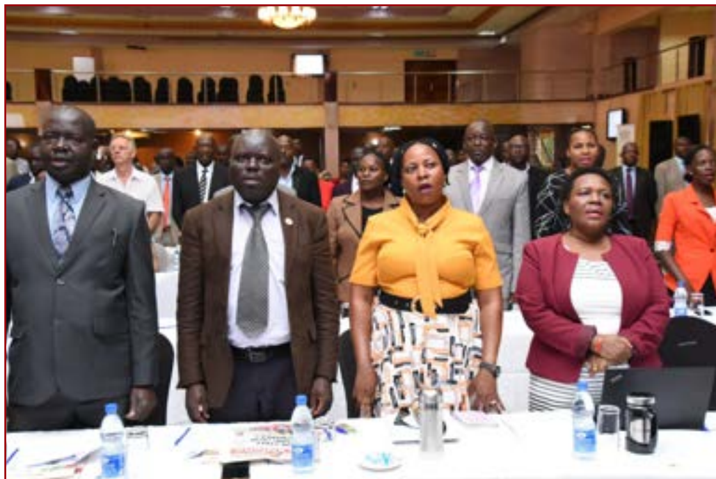
Figure 2: Across Section of Participants at the National Conference on Decentralisation singing the National and East African Community Anthems