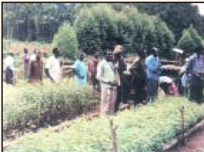
Members of Butamira Environment Pressure Group at a consultative meeting with ACODE

Kakira Sugar Works was granted permission and a new permit was issued effective July 28, 1998. 23 Unlike the previous permit, the new one gave the Company the rights to put the entire Reserve under use for general purposes and the original conditions were ignored. We have observed elsewhere that on the basis of the new permit, KSW embarked on a scheme to clear the existing forest reserve and replace it with a sugar cane plantation. 24