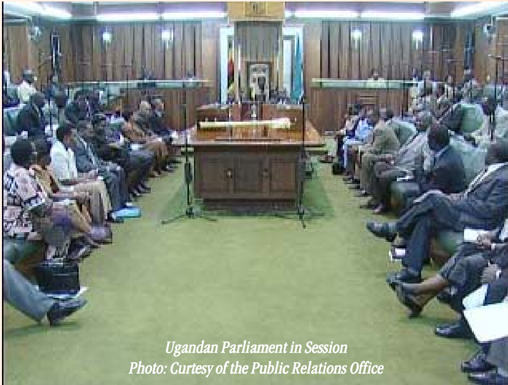
Ugandan Parliament in Session

A number of observations may be drawn from the discussion of this case study above. First, for the first time in the history of legislative Uganda, we see a Member of Parliament championing the environmental interests of his voters from beginning to the “end.” v The MP did not only assist the local tree farmers by presenting their petition to Parliament, he also assisted them as they went through constant harassment and intimidation from some Government officials. Secondly, as the debate on the petition progressed, the MP became increasingly dissented by several of his peers particular from the Busoga Kingdom area. However, this did not deter him from remaining steadfast in representing the petitioners in which his voters were the majority.